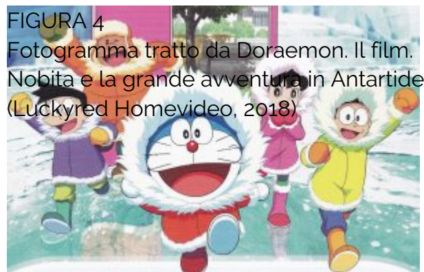
FIGURA 4 Fotogramma tratto da Doraemon. Il film. Nobita e la grande avventura in Antartide (Luckyred Homevideo, 2018)

The influence of animalism and ecocentrism is even more evident in the anime Barbapapa (KSS, 1974) that has an admittedly ecological message influenced by the animalist and anti-speciesist philosophy. There is a strong dichotomy between good (nature in all its forms) and evil (anthropic development). The message is that all species have the same dignity and the same right to inhabit the Earth.