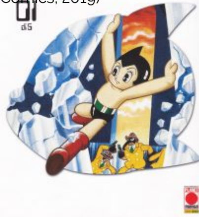
FIGURA 1 Copertina del manga Astro Boy di Tetsuya Atom (Panini Comics, 2019)

At the center of the first series there was the relationship between man and technology (Sabanovic 2014): in Astro Boy (Mushi Productions, 1963-1966) the protagonists are science, nuclear energy and technology, considered the pillars with which to build the future of Japan. At the same time, the cartoon series (Eitj and LaMarre 2008, Gibson 2012, Gibson 2013) raises questions about the technological nature of Astro Boy (a robot with a sentient brain): can it be considered a living being or is it just a machine?