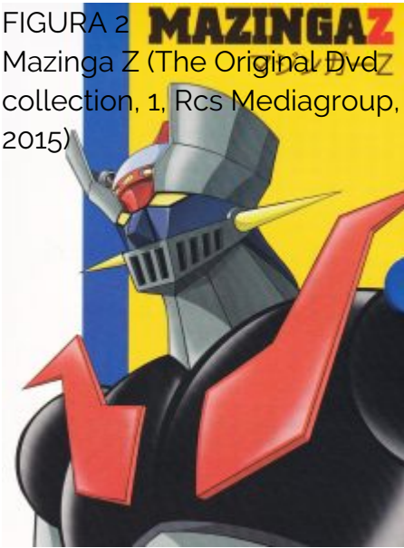
FIGURA 2 MAZINGAZ Mazinga Z (The Original DvdZ collection, 1, Rcs Mediagroup, 2015)

At the end of the 1970s, anime introduced new topics such as those posed by the development of biotechnology and information technology. The Daitarn 3 series (Sunrise, 1978-1979) puts at the center of the narrative the theme of dualism between the naturalness of man and the artificiality of the machines. Man is the bearer of the positive values of humanity, while the Meganoids (enemies whose nature is artificial) are carriers of the negative values.